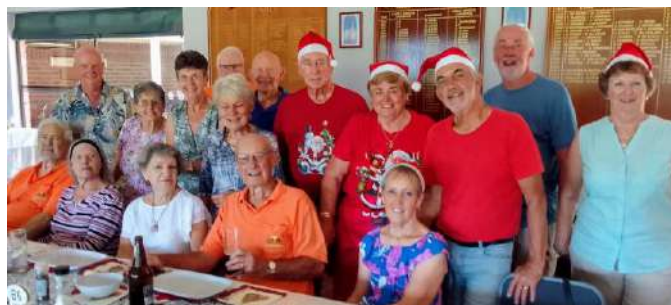
HITCH UP CHRISTMAS LUNCH: 16 members attended the Christmas braai and the ladies provided salads and puds aplenty. It was a lovely round off to 2024.