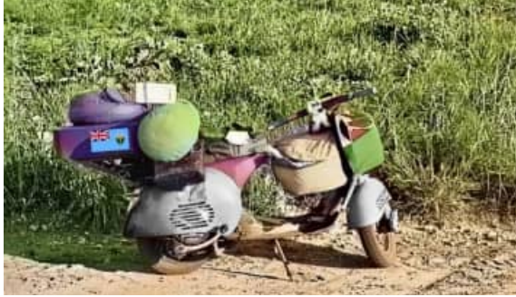
Claude's trusty Vespa GS loaded and ready – somewhere Claude found space for himself.