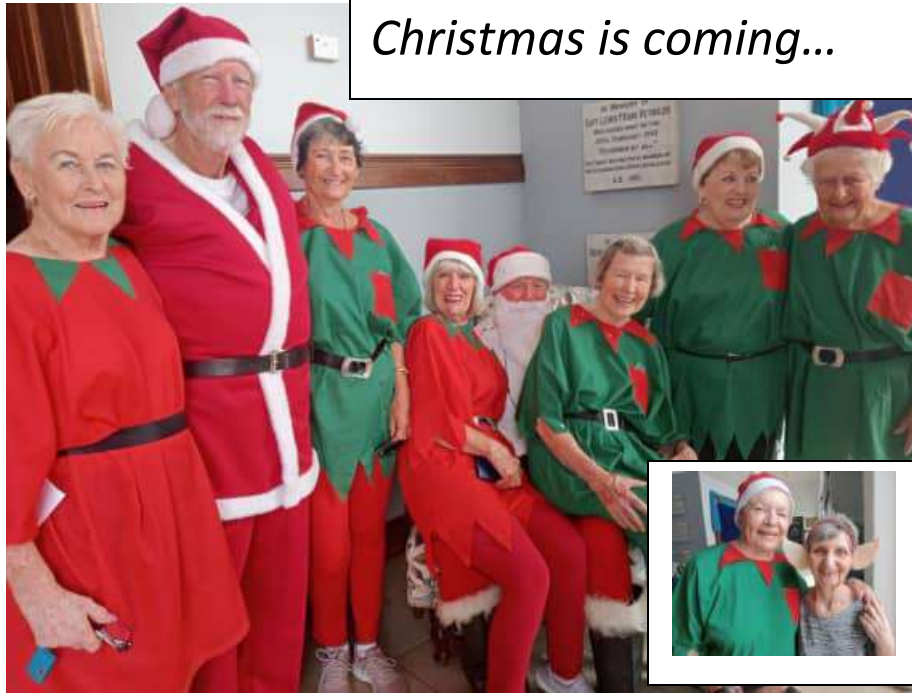
Christmas is coming...